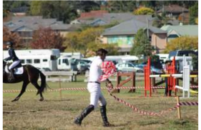
Our own President is always busy doing something

for our major 3DE's. The 2015 calendar is out and the Executive hopes it works for everyone. We will start to organise 2016 calendar in the coming months to allow our clubs to get the dates both we and they need.