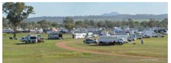
Quirindi Panorama April 2014

To our clubs, thank you to all your committee members for producing all the events you run for our members, and to the volunteers who help you do this. I would like to encourage clubs to strive for bigger and better events at every chance you can to help prepare our horses and riders for those major events. Things like signage from sponsors, music and trade villages around arenas will only help your events and help acclimatise our horses for those major events. Allowing horses to have access to competition areas before competition to encourage better performances which helps our horses and riders and viewing for spectators at your events. At the WEG competitors were allowed to work their horses in the dressage arena and in the Show Jump arena before competition started.