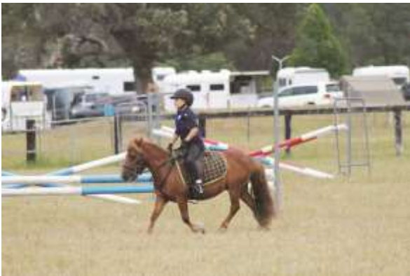
A junior rider enjoys instruction at the Mirrabooka Junior clinic

It's been a good year for Eventing in NSW. We have had large numbers of riders competing at our events, with most country events building on their entries from previous years and the 'city' events proving as popular as ever.