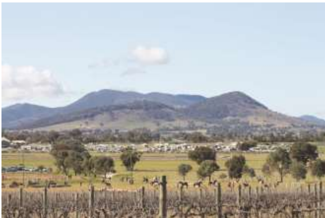
Mudgee ran a very successful event this year

It's been a good year for Eventing in NSW. We have had large numbers of riders competing at our events, with most country events building on their entries from previous years and the 'city' events proving as popular as ever.