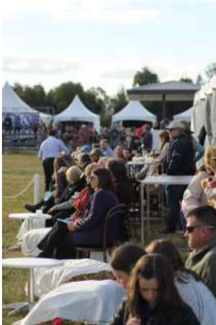
The more atmosphere our clubs can provide, the better!