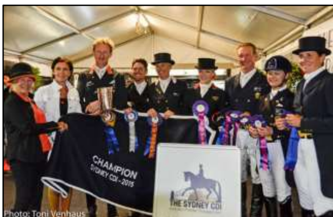
Sydney CDI Grand Prix Presentation

Whilst the Amateur Owner Rider (AOR) is proving very successful, Participation classes have had very little take up in NSW, general feedback is that they are not worth running and only 4 clubs have offered them to date. Clubs simply don't think it worth their while.