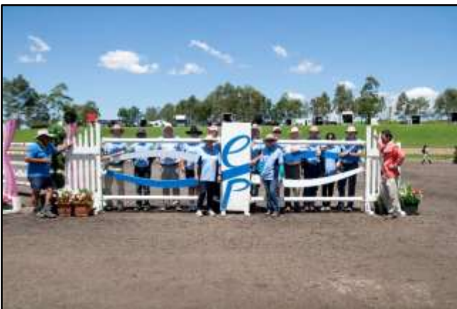
The hard working team at Summer Classic