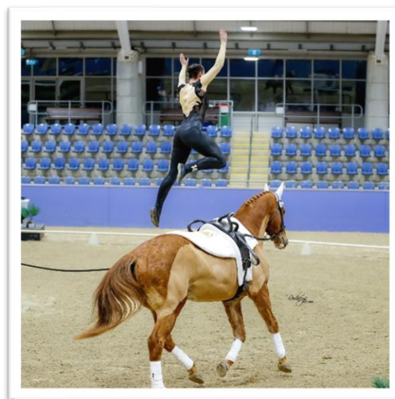
The VNSW State Championships