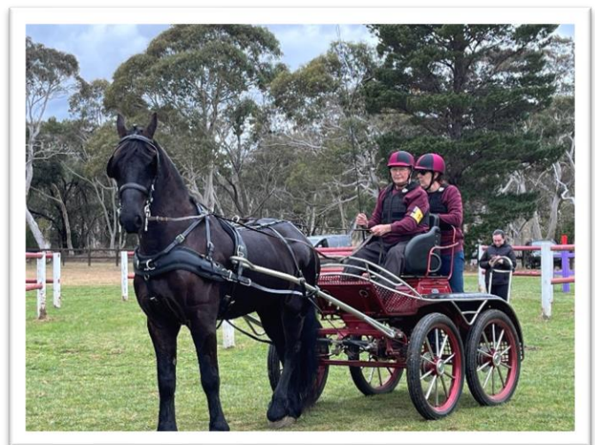
Queensland competitors at the Zilco Ashes Driving Competition

The Education committee has continued to review the needs of the NSW Equestrian Community. Two of the major achievements have been the continued growth of the Learning Management System and the pilot of the Future Leaders program. The Learning Management System was set up to provide a one-stop-shop for Equestrian Clubs, it has rapidly expanded and now has coaching materials as well as Child Protection training and information added by Equestriab Victoria. The Future Leaders program matches young equestrians with mentors to assist them in pursuing their goals as equestrian officials and coaches. The Future Leaders program has partnered with the Duke of Edinburgh scheme with the long-term goal of having