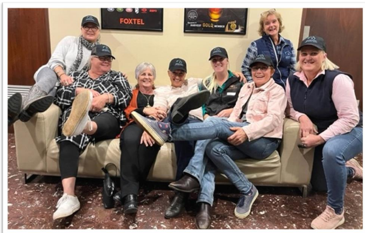
Committee members from Dubbo region clubs attending a regional clubs forum focusing on risk management