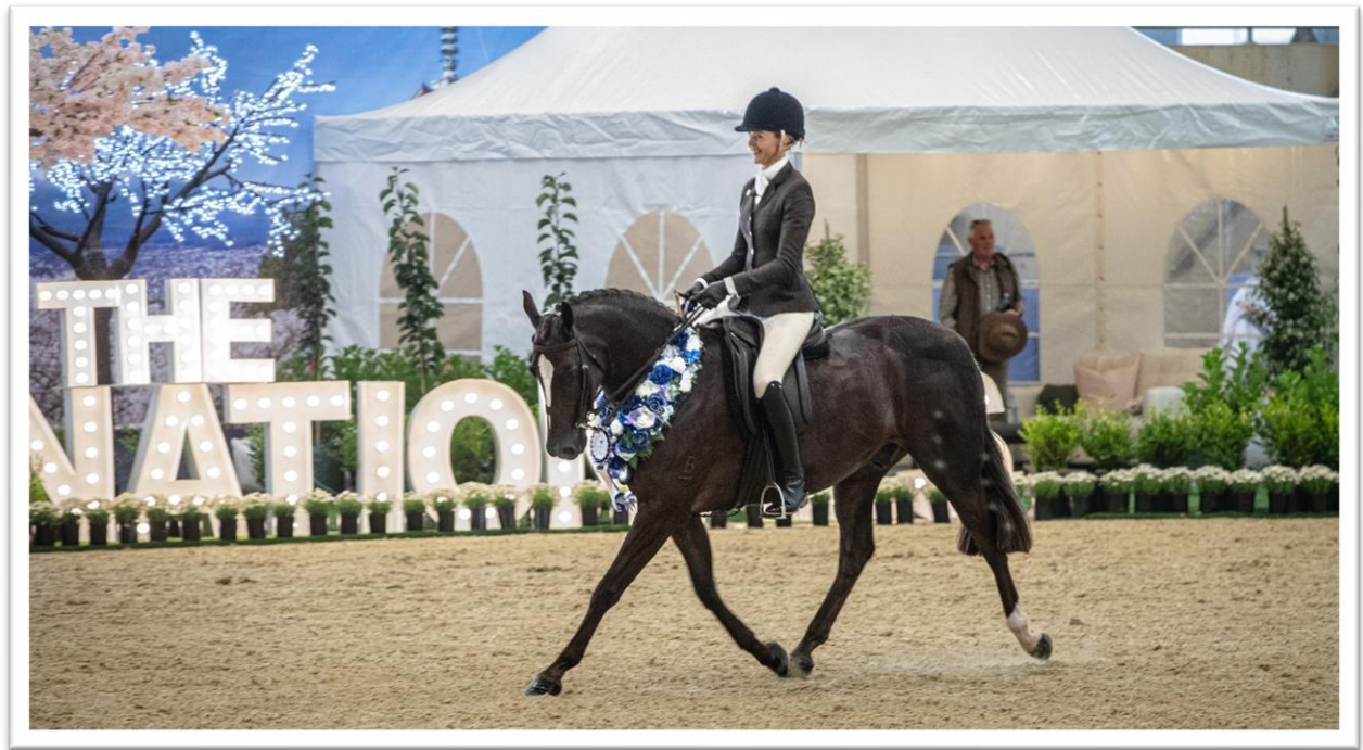
The Australasian Show Horse & Rider Championships held in NSW for the first time in 27 years