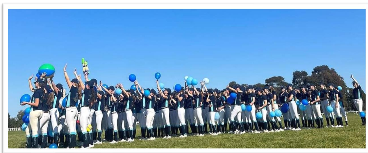
ENSW State Interschool Team ready for the opening ceremony at Werribee

NSW hosted the National Interschool Championships in September 2022 with children, their parents and team managers attending from every state in Australia for 5 full days of competition. The NSW team of 96 ranging in age from year 2 to year 12 were awarded Champion Overall Team, Champion Eventing Team and Champion Show Horse Team with 94 individual top 10 placings amongst the team. The team received a further accolade in June this year when they were awarded the title of Champion Community Team at the NSW Sports Awards.