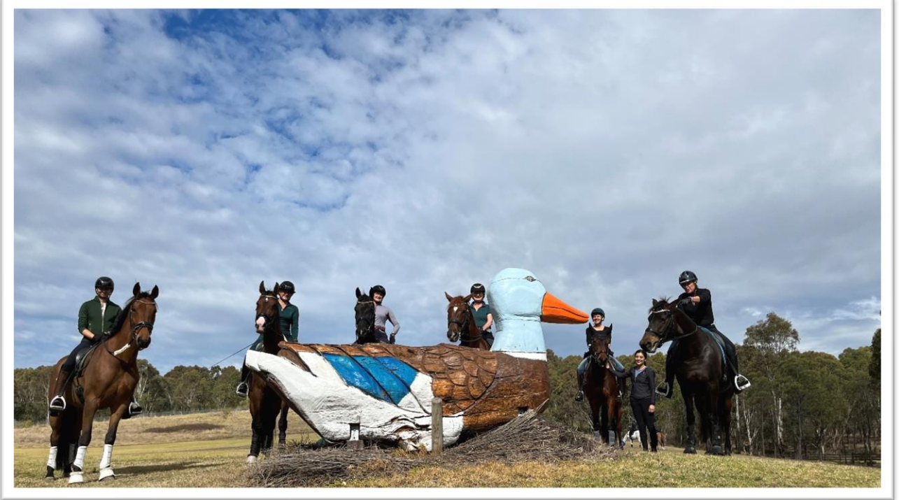
Dressage riders enjoying the SIEC cross country course at the inaugural ENSW Members Day - an activity identified through the strategic planning process.

The Equestrian NSW Board thanks the members for their ongoing support and commitment to equestrian sport in NSW.